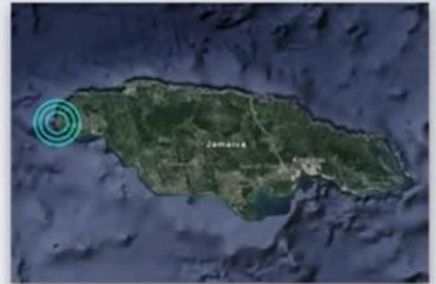
Map of Jamaica