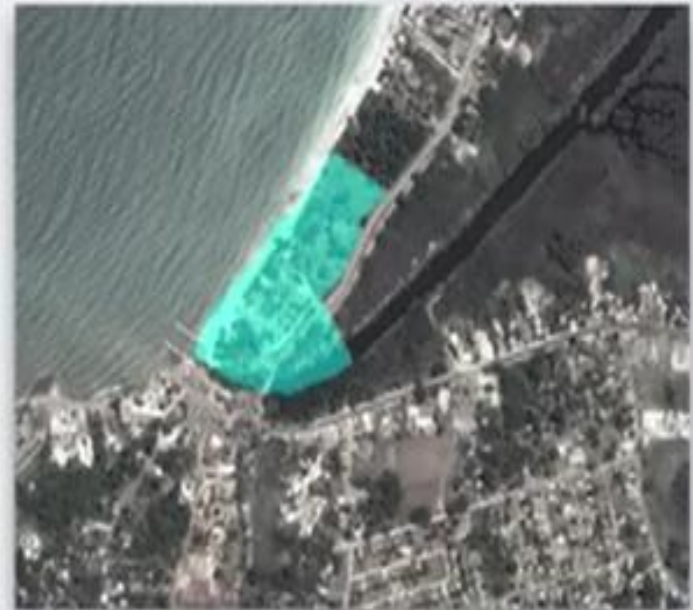
Map of Negril