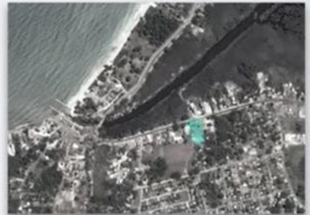
Map of Negril