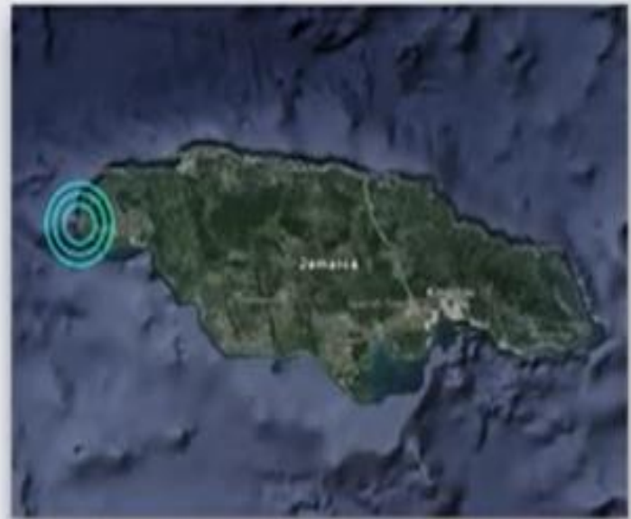
Map of Jamaica